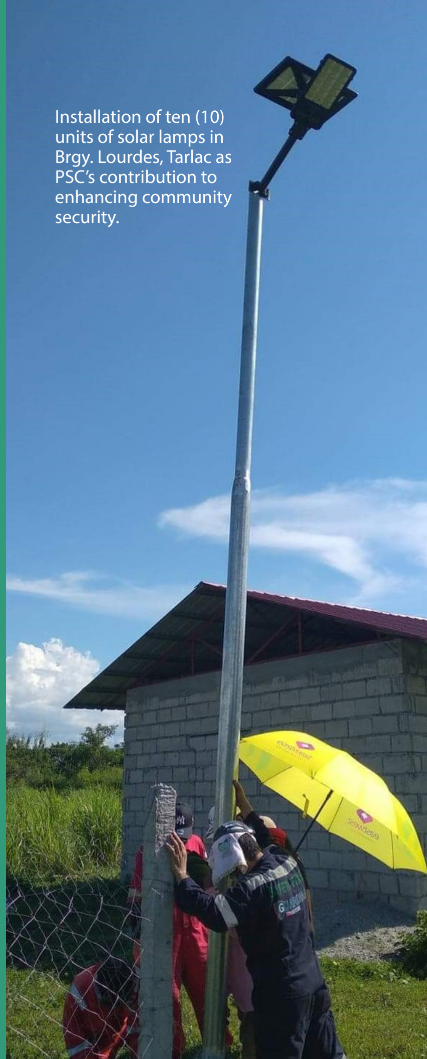
Installation of ten (10) units of solar lamps in Brgy. Lourdes, Tarlac as PSC's contribution to enhancing community security.