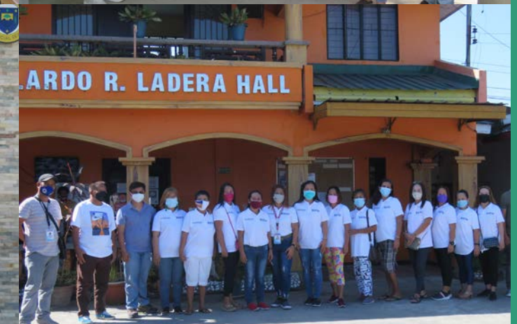
Distribution of uniforms of Barangay Health Workers in five (5) Barangays in Tarlac