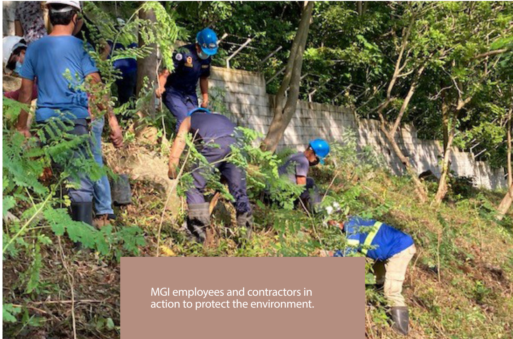
MGI employees and contractors in action to protect the environment.