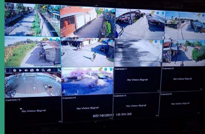
Installation of 10 units of CCTV cameras in Brgy. Balete, Tarlac to improve security monitoring in the Barangay.