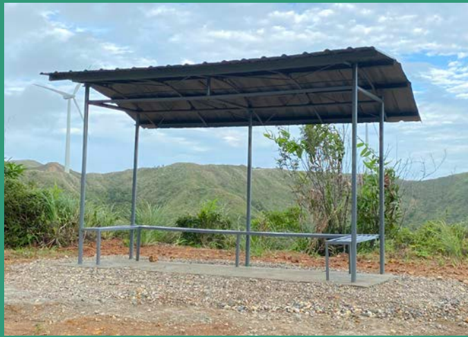
Installation of additional waiting sheds along barangay access road from Brgy. Unidos to Pawa in Nabas, Aklan.