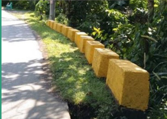
Painting of road rail guards in Barangay Puting Lupa, Sto. Tomas, Batangas.