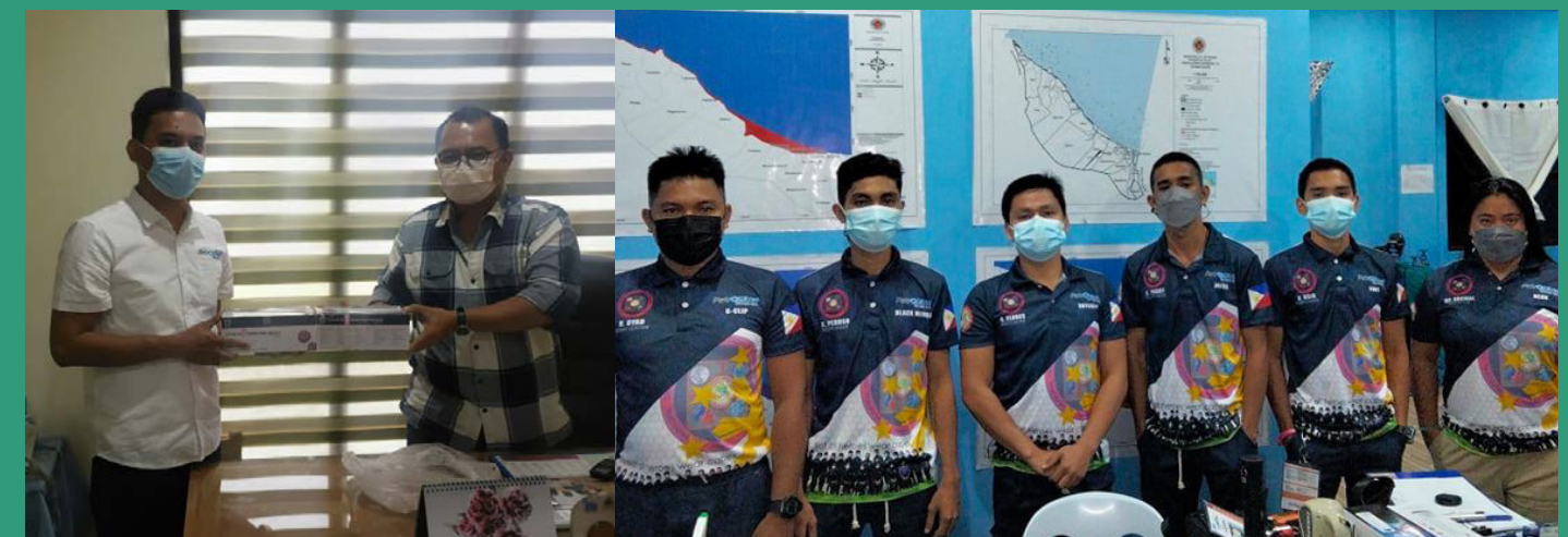
Turn-over of 50 antigen test kit to Nabas LGU and uniform sponsorship to Municipal Disaster Risk Reduction Management Office (MDRRMO) Nabas rescue